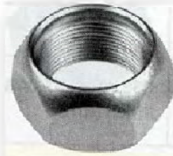
KB14201R / L